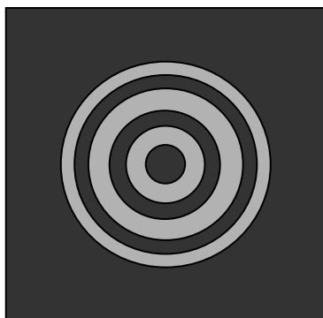
Figure 3. Star pattern of collimated scope.

At this point your scope will probably be out of collimation (Figure 2). Now tighten and loosen appropriate knobs until the mirrors and their reflections are once again concentric (Figure 1), and the secondary mirror is held securely. (Knobs should just be snug enough to hold the secondary securely; over-tightening could damage either the secondary threads or the knob.) If a knob becomes somewhat harder to turn when tightening, loosen the opposite knobs slightly instead. Check your owner's manual for additional guidance for your particular telescope.