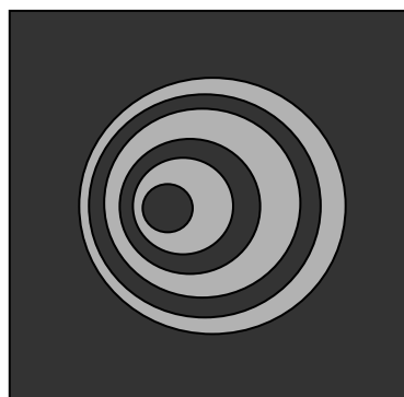
Figure 4. Star pattern of uncollimated scope.